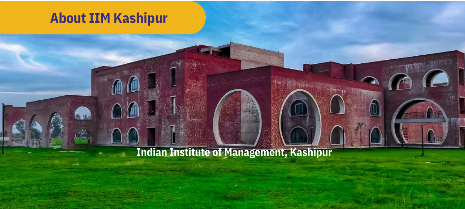
Indian Institute of Management, Kashipur

The Indian Institute of Management Kashipur (IIM Kashipur) is second-generation IIM set up by the Government of India in 2011. It aspires to achieve excellence in management education by using innovative teaching methods, promoting high-quality research, and practicing sustainable leadership. The institute strives to create and disseminate knowledge through applied and interdisciplinary research and practices in emerging areas of management. The institute develops socially conscious, competent, and ethical business leaders and researchers capable of critical thinking, innovation, and entrepreneurship while being inclusive and focusing on both regional development and internationalization. Celebrating ten years of serving the education, the institute is ranked,